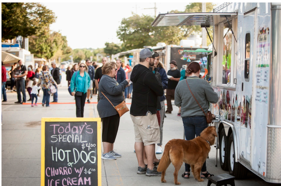
A small group of people order a meal from a food truck while a golden retriever dog watches with interest.