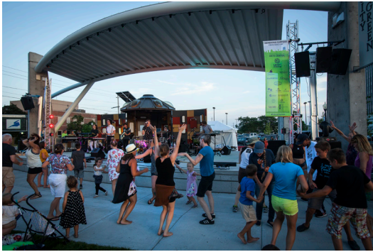
A group of people dance in front of the stage while the band Sweet Crude performs at the Levitt AMP Sheboygan Music Series.

I can sit and listen or get up and dance to the music.