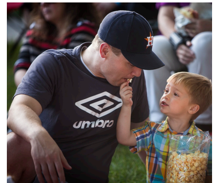
A young boy in multicolored shirt shares popcorn with man in a dark blue shirt and hat during a concert at the Levitt AMP Sheboygan Music Series.