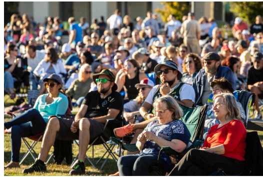
A crowd of people seated in lawn chairs watches a band perform at an outdoor concert.

I can find many drink options by the Beverage Tent (yellow flag), or I can bring in my own drink, but there are no alcohol carry-ins allowed.