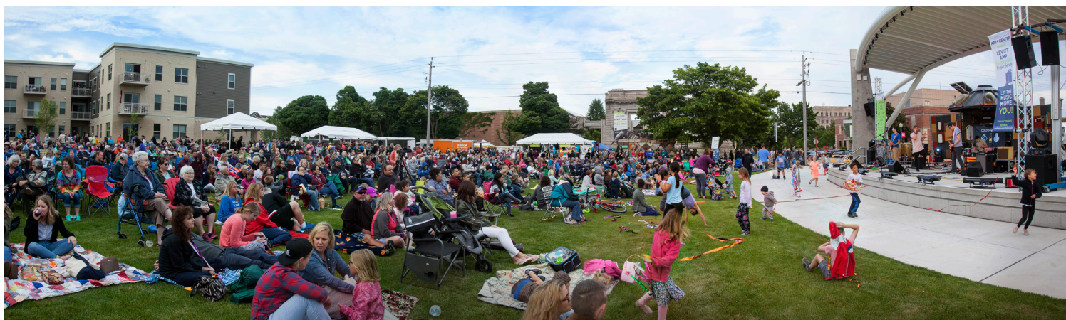
A seated crowd watches the band Cold Soda Club perform on an outdoor stage as children dance and play during a Levitt AMP Sheboygan Music Series concert.

I can plan my night at Levitt AMP Sheboygan Music Series with help from my family or friends. I can visit the event website, www.jmkac.org/engage/programs/levitt-amp-sheboygan-music-series , for more information before my visit.