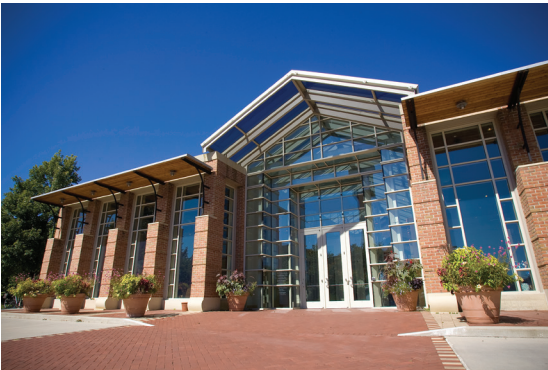
The Arts Center's glass entry doors are always unlocked during the Levitt AMP Sheboygan Music Series concerts.

I will remember to stay with my family or friends and be sure to follow all of the rules for the night at the concert.