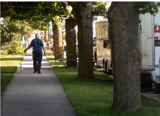
A man walks his small white dog down a tree-lined sidewalk.

I will ask to take a break and go to the quiet areas inside the Arts Center if the noise, sounds, and smells are too much. After taking a break, I can return to the City Green.